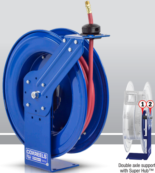
Double axle support with Super Hub™

COXREELS® SH Series "Super Hub™" spring driven hose reels, like the P Series, have a long history of dependable performance. The larger chassis and frame accommodate longer lengths and larger diameters of hose. Coxreels' original Super Hub™ dual axle support system increases the stability during operation, reduces vibration and strengthens the structural integrity of the reel.