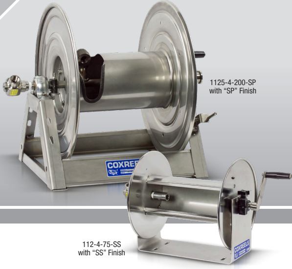
1125-4-200-SP with "SP" Finish