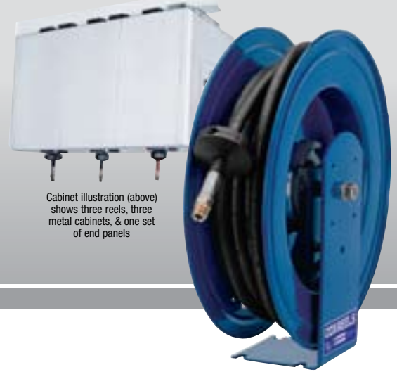
Cabinet illustration (above) shows three reels, three metal cabinets, & one set of end panels