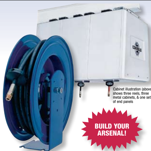
Cabinet illustration (above) shows three reels, three metal cabinets, & one set of end panels