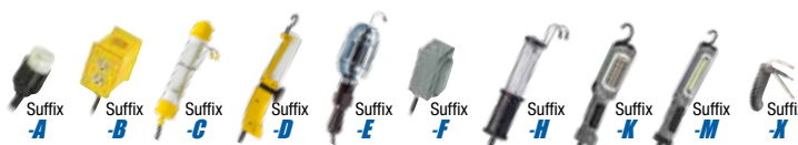
POWER CORD & LIGHT OPTIONS