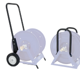
PORTABLE HOSE REEL