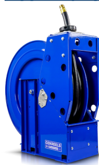
FLOOR OR CEILING MOUNT