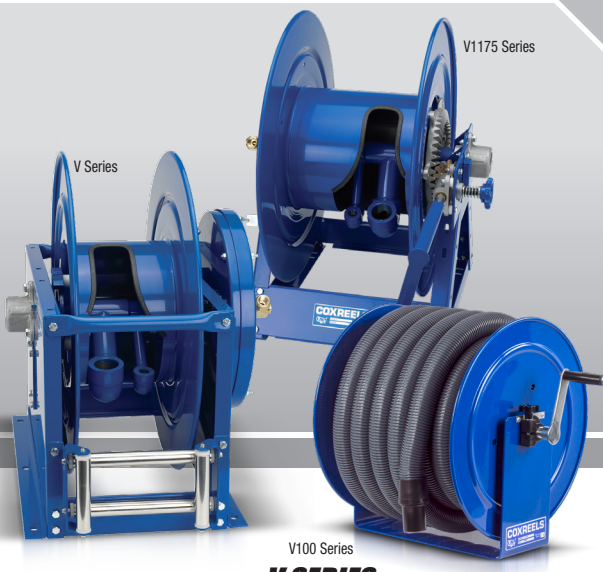
V SERIES :: REEL SPECIFICATIONS