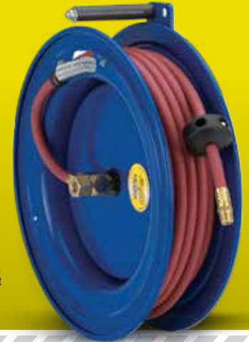
Reel Orientation: Right Mount is shown with mounting base on the right side & hose payout from the top of the reel