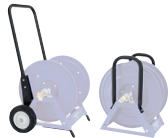
PORTABLE HOSE REEL